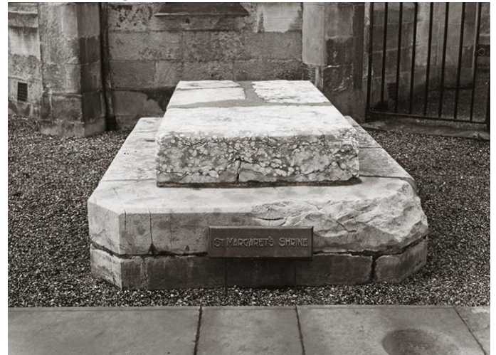
St. Margaret's shrine as it appears today

Margaret was herself a frequent user of the Queensferry crossing, travelling between Edinburgh and Dunfermline. She helped to establish the town as one of Scotland's most important religious centres when she converted Holy Trinity church into a priory. At her encouragement, a small community of monks from Canterbury laid the foundations of the first Benedictine house in Scotland. Margaret's son David I raised the status of her priory to abbey in 1128. This grand building has provided a final resting place for several of Scotland's great kings and queens, including Robert the Bruce and, fittingly, Margaret herself. In 1199, King William the Lion was supposedly dissuaded from invading England after he saw a vision while praying at her tomb.