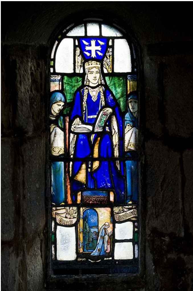
St. Margaret depicted in stained glass at Edinburgh castle